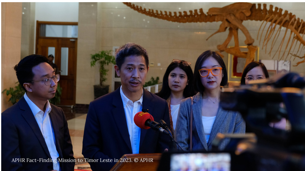
APHR Fact-Finding Mission to Timor Leste in 2023.