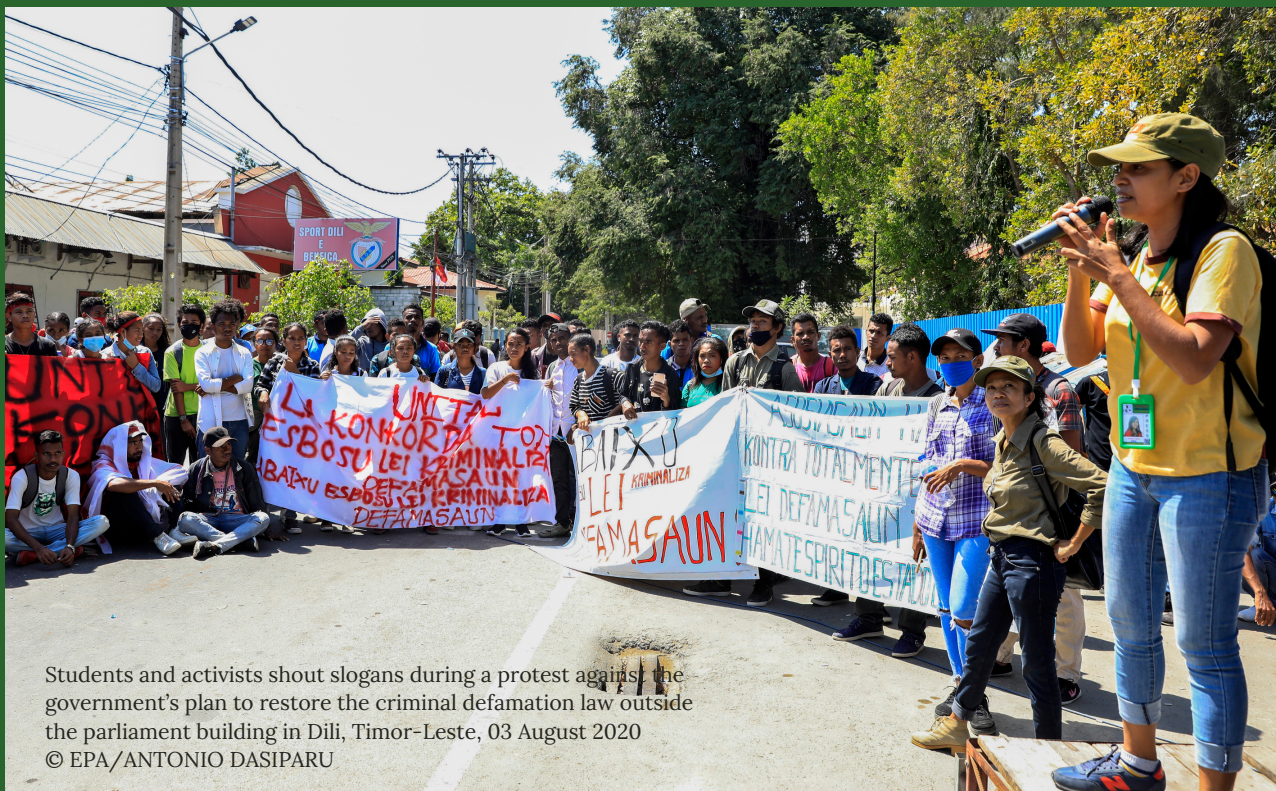
Students and activists shout slogans during a protest against the government's plan to restore the criminal defamation law outside the parliament building in Dili, Timor-Leste, 03 August 2020

In 2021, two bills were presented in the parliament, namely the Cyber Crime and Data Privacy Bill. These proposals sparked concerns among the public, especially journalists, activists, and human rights defenders for its lack of human rights safeguards. The Cyber Crime Bill came with the need for a stronger cyber security legal framework as the country attempts to expand its digital access and penetration. 28 It was previously claimed that the Cyber Crime Bill would focus solely on the technical aspects of internet infrastructure to prevent the increasing risks of cyber crimes.