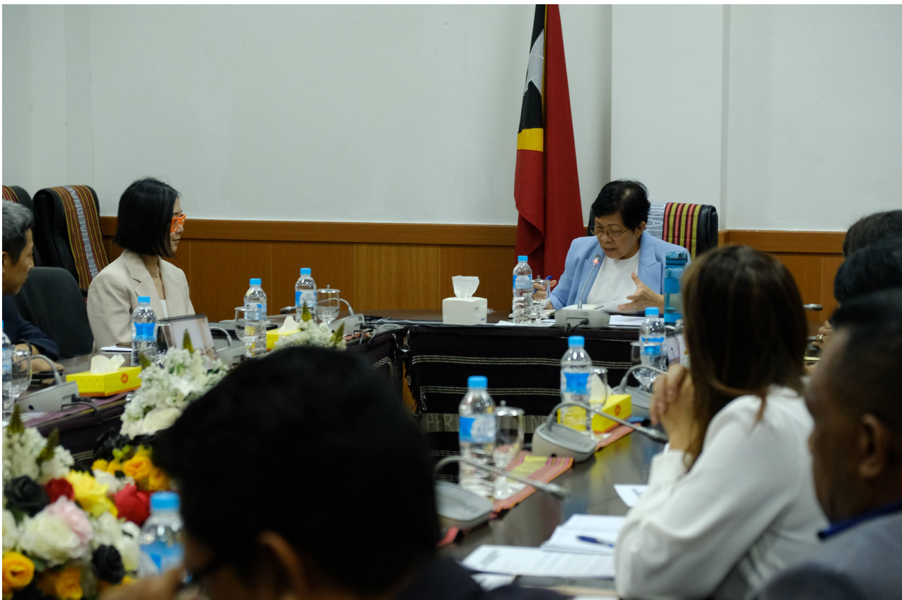
APHR Meeting with the House Speaker and Members of the Timor-Leste National Parliament on 2nd October 2023.

Fostering media and digital literacy is critical to empower and protect individuals from threats and risks in cyberspace. By equipping both citizens and the authorities with digital literacy skills, Timor-Leste can promote a safer and more inclusive online environment, ultimately safeguarding the democratic progress the country has achieved.