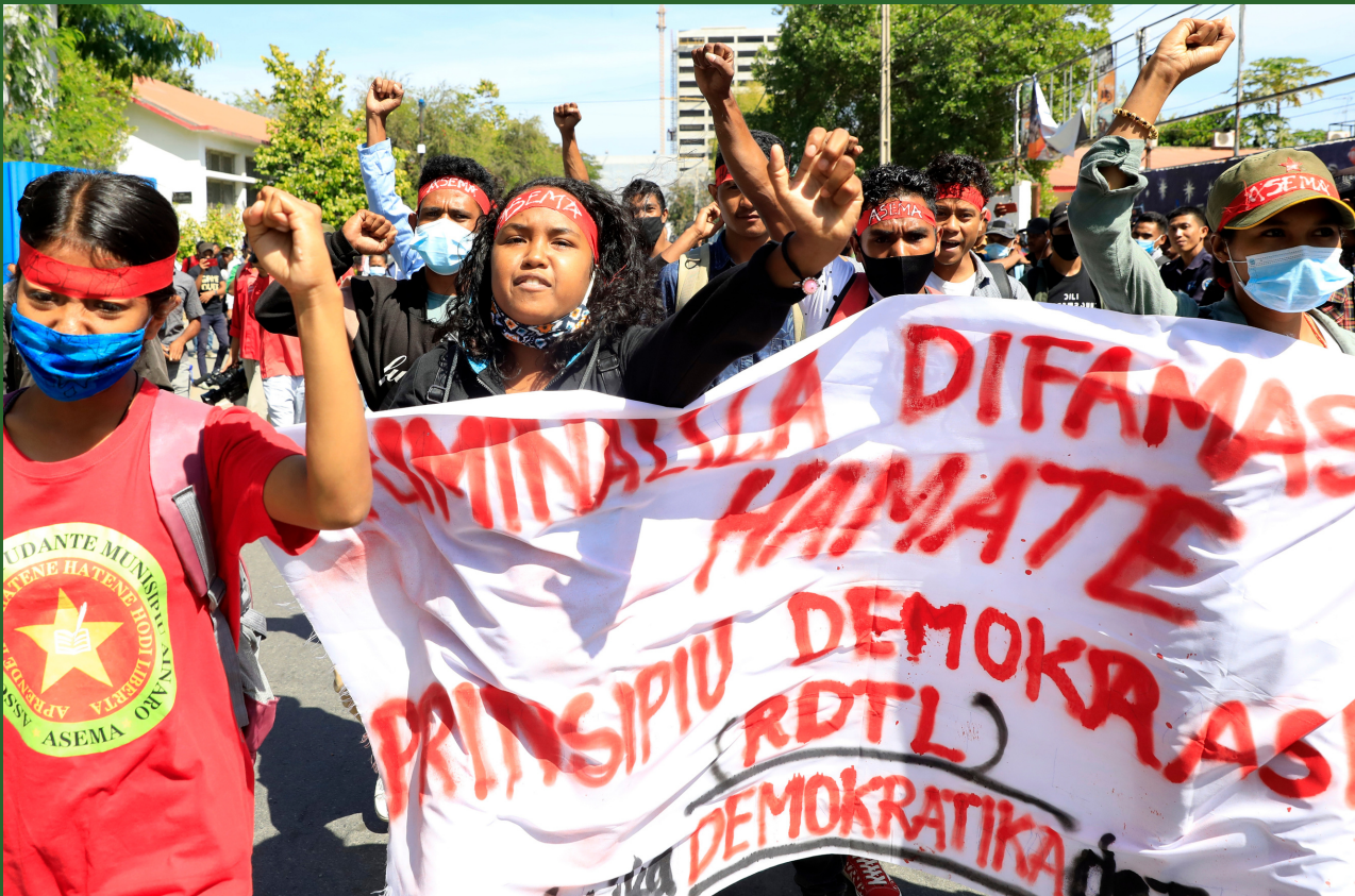
Students and activists shout slogans during a protest against the government's plan to restore the criminal defamation law outside the parliament building in Dili, Timor-Leste, 03 August 2020.

During the Fact-Finding Mission, it also appeared that government institutions highlighted the concerns over the absence of legal framework for government and ISPs to censor, block, or surveil prohibited contents such as pornography and gambling. These concerns contributed to the push of the Bill.