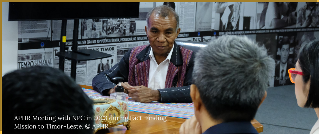
APHR Meeting with NPC in 2023 during Fact-Finding Mission to Timor-Leste.

The Conselho de Imprensa (CI) , established in 2014 through the Media Law, is among key institutions in safeguarding fundamental freedoms. It aims to safeguard human rights, promote civic space, and independent media. The Council consists of five members; two journalists representatives and one mass media organization representative are elected and two representatives nominated by the National Parliament.