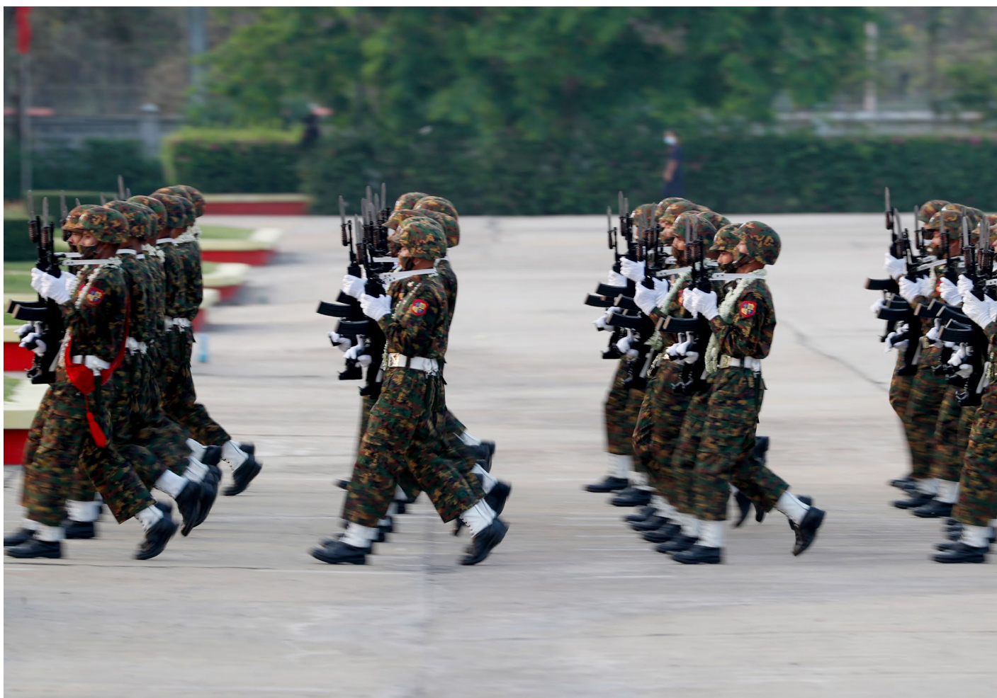
Photo: Myanmar soldiers march during a parade commemorating the 77th Armed Forces Day in Naypyitaw, Myanmar, 27 March 2022.