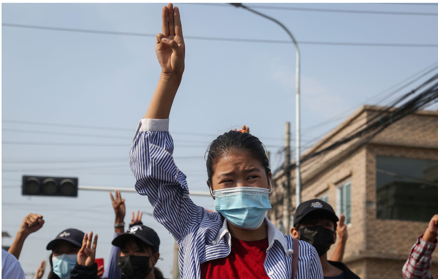
Photo: A demonstrator flashes the three-finger salute during an anti-military coup protest in Mandalay, Myanmar, 18 May 2021.