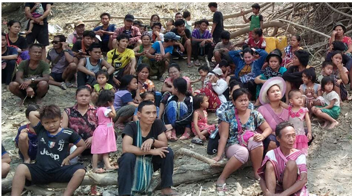
Photo: Ethnic Karen villagers fleeing from air attacks by Myanmar military take rest in a jungle after crossing border at a Thai-Myanmar border in Mae Hong Son province, Thailand, 28 March 2021