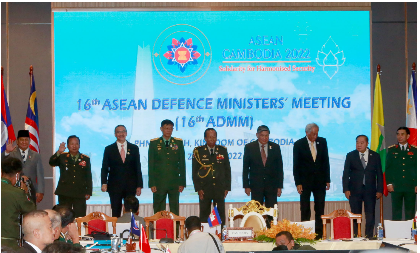
Photo: The 16th ASEAN Defence Ministers' Meeting in Cambodia © EPA-EFE.