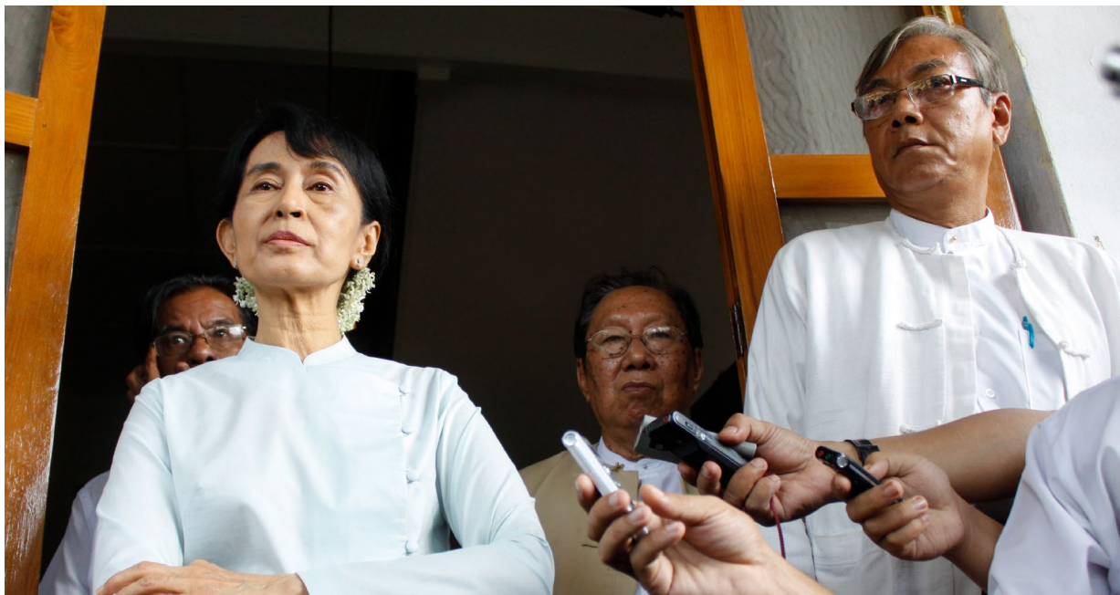
Photo: A picture made available on 10 March 2016 shows Htin Kyaw (R), standing next to Aung San Suu Kyi during a press meeting at her residence in Yangon, Myanmar © EPA-EFE

In 2003, the SPDC announced its seven-step road-map to what it described as a “discipline-flourishing democracy”, which included the drafting of a new Constitution, elections and then ceding power to a new civilian government. The Constitution, in which the pro-democracy forces had no say in drafting, was eventually approved in 2008, in a referendum widely condemned as a sham that took place days after Cyclone Nargis devastated wide areas of the Myanmar Delta, killing at least 130,000 people. 22