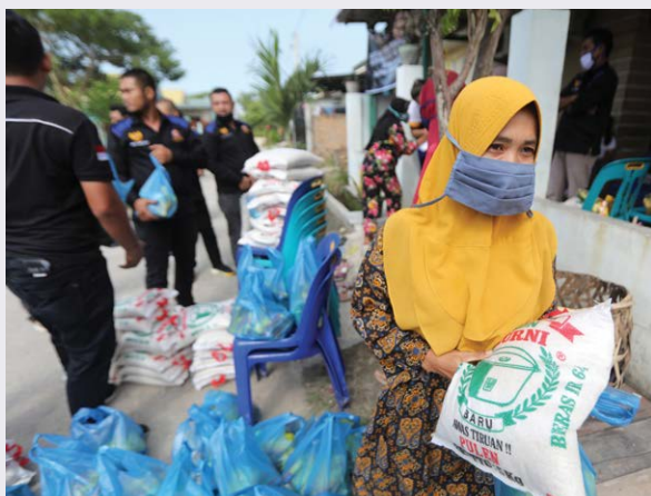
People wear protective face masks as they receive social assistance packages amid the coronavirus pandemic in Deli Serdang, North Sumatra, Indonesia.

The monetary value of recovery packages ranged from USD 254 million in Timor-Leste to USD 115 billion in Indonesia. 64 To finance their packages, governments took mixed strategies, from drawing from national reserves and wealth funds to obtaining loans and grants from bilateral and multilateral agencies, such as the US Federal Reserve Board, World Bank, and the UN.