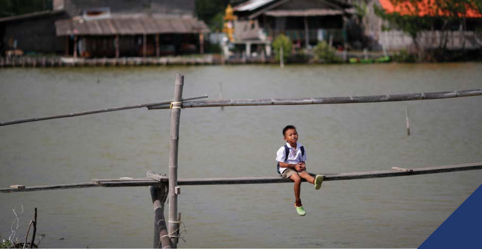
A student sits on a wooden bridge as sea water rises invading the land at the coastal erosion community of Ban Khun Samut Chin village, off the shore of Samut Prakan province, Thailand.