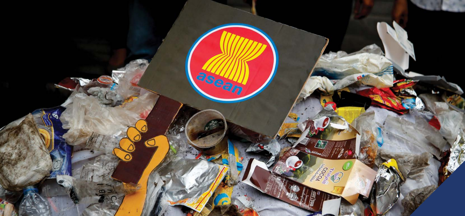
An ASEAN flag is placed on top of a pile of waste by Greenpeace activists calling for a stop to waste dumping, in front of the Ministry of Foreign Affairs in Bangkok, Thailand.