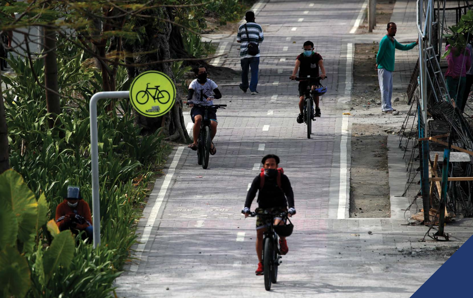
Bikers pedal along a newly-constructed bike lane in Manila, Philippines.