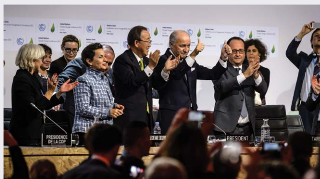
Delegates including then-French President Francois Holland and then-UN Secretary-General Ban Ki-moon after the adoption of the COP21 final agreement at the World Climate Change Conference 2015 (COP21) in Le Bourget, north of Paris, France, in December 2015.

The Paris Agreement was signed in December 2015 under the UN Framework Convention on Climate Change (UNFCCC). The central objective of the Paris Agreement is halting the global temperature increase to well below 2 degrees Celsius, preferably to 1.5 degrees Celsius. 18 Countries that have signed the Paris Agreement are members of the Conference of the Parties (COP). The COP meets every year. The next meeting, COP26, was postponed to November 2021 in Glasgow, UK, due to the pandemic.