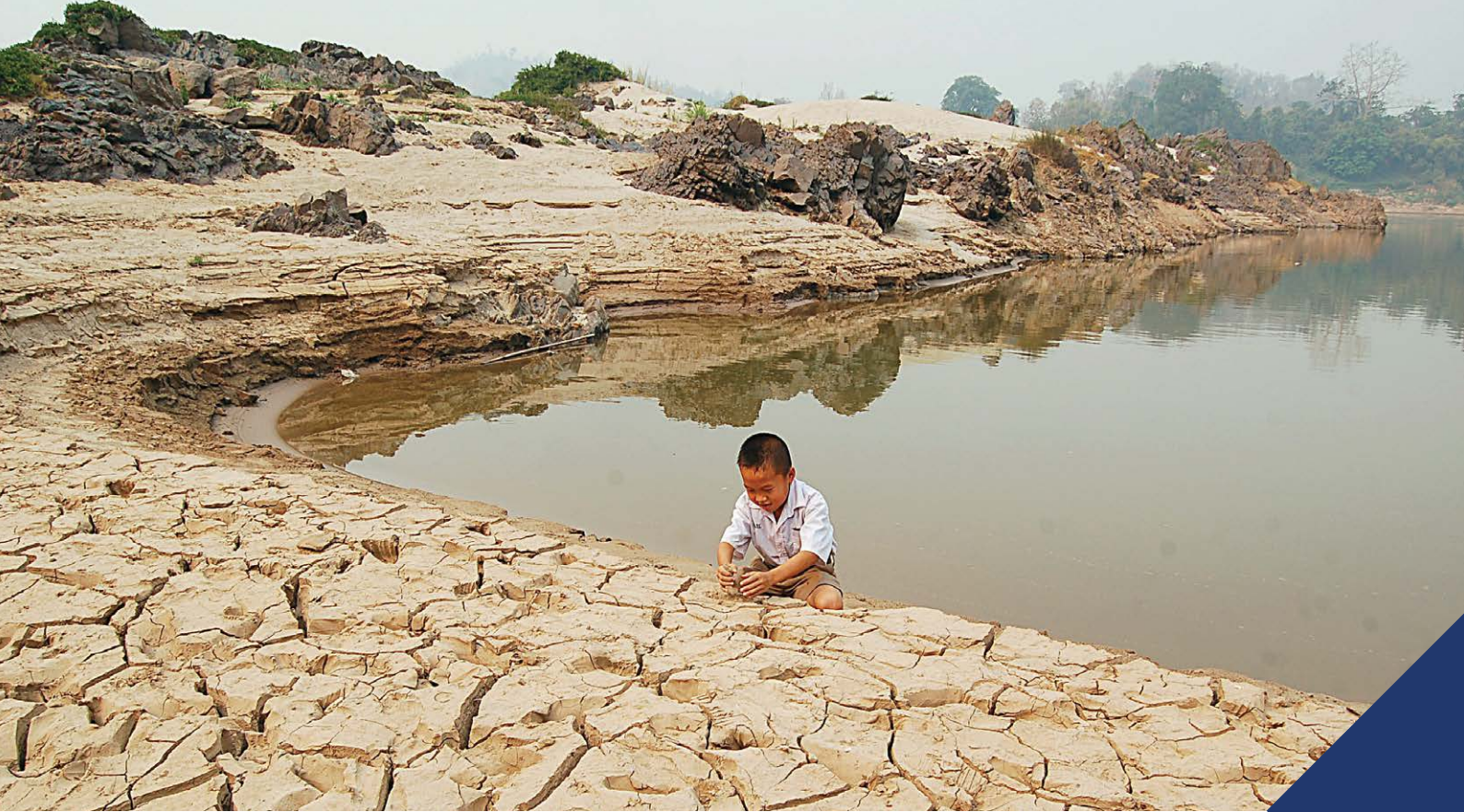
A boy plays on a dried up reservoir of the Mekong River following a drought affecting the Thai-Lao border city of Wiang Kaen, Chiang Rai province, northern Thailand.