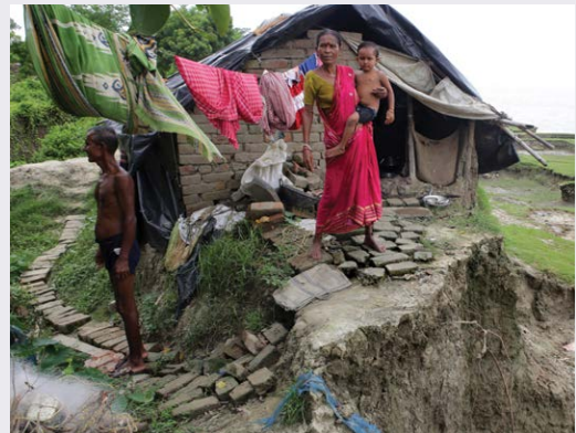
Villagers at their home on Ghoramara Island, which is submerging into the Bay of Bengal, about 160 kms south of Calcutta, Eastern India.

Right to work and an adequate standard of living: Alongside more frequent and intense natural disasters, climate change imperils millions of lives and livelihoods that depend on the health of natural resources, including agriculture, fisheries, forestry, and tourism. In particular, the jobs of more than 90 million agri-food workers across Southeast Asia will be affected by lower crop yields and stagnant labor productivity attributed to climate change. 57