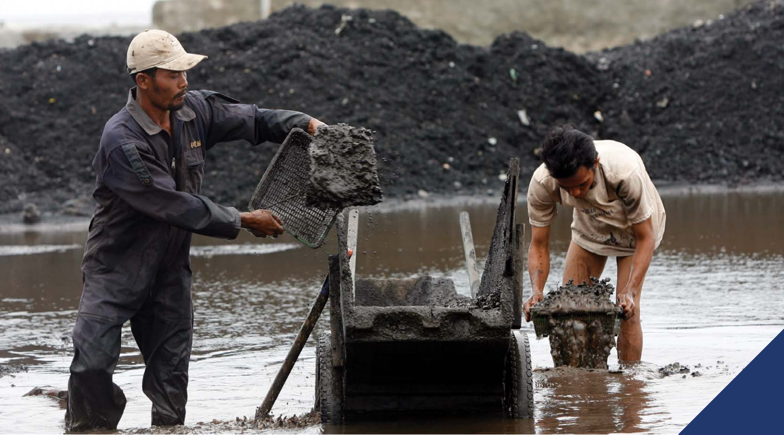
Workers load coal into a handcart at an old unused coal terminal in Jakarta, Indonesia.