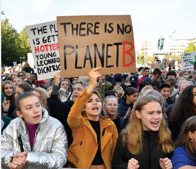
Climate demonstrators in Stockholm, Sweden as part of a student strike movement called Friday for Future.

Intergenerational equity is the principle that generations have certain duties to those that follow behind them. This principle can be applied to the socioeconomic and environmental impacts of COVID-19 recovery measures and climate change. These duties include ensuring the use of natural resources supports the sustainable functioning of the planet's ecosystems and taking effective action to protect children and the unborn against the adverse effects of climate change. 38