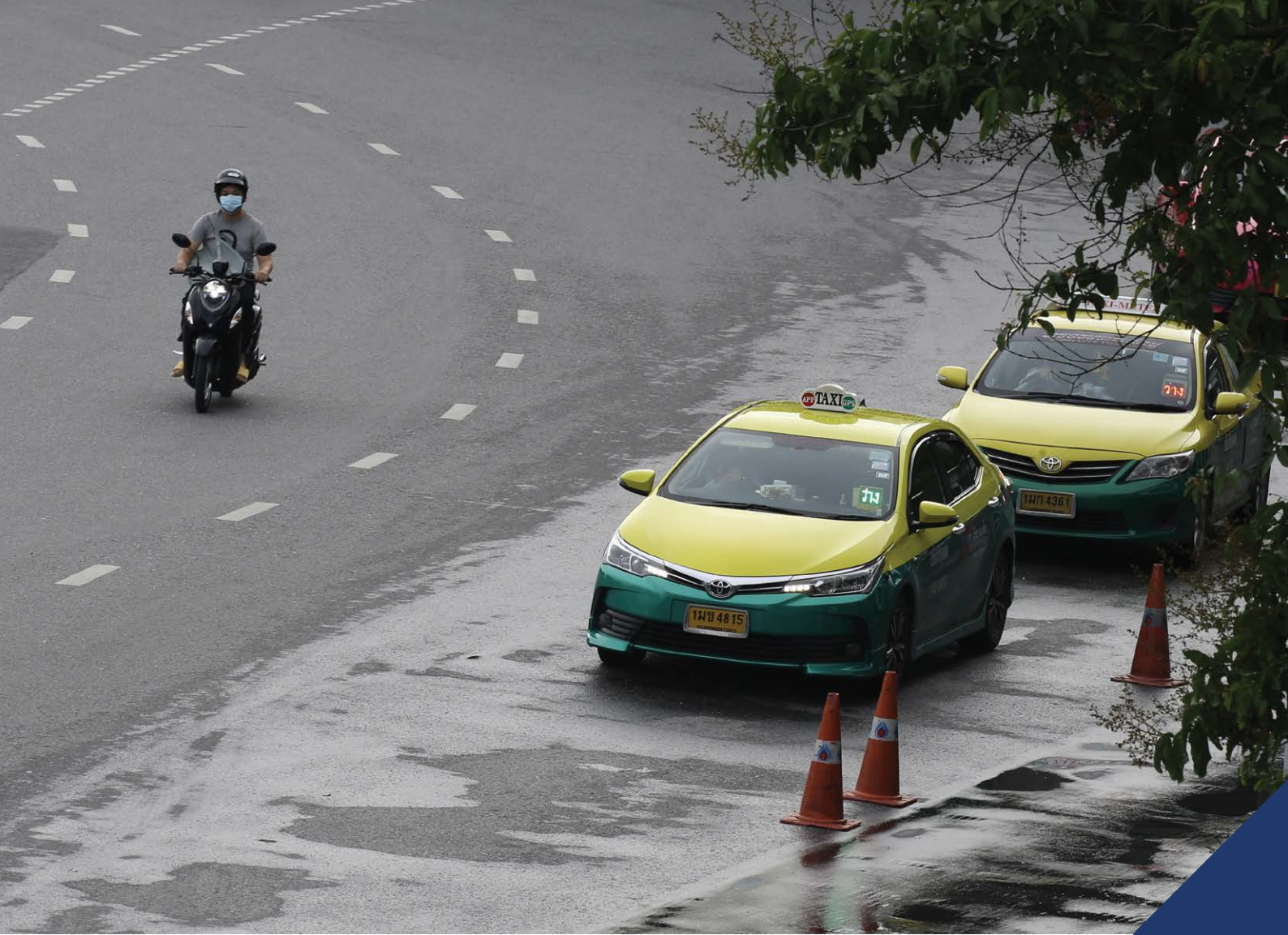
Taxis wait for passengers on the side of a nearly empty road, in Bangkok, Thailand.