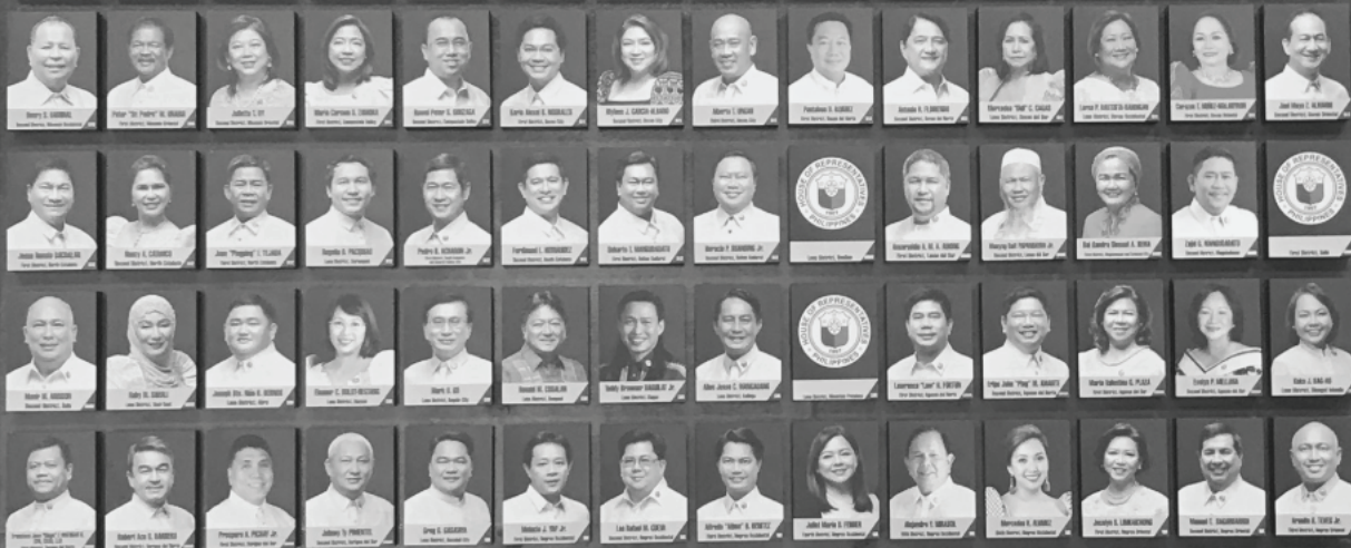
Poster showing some of the Representatives of the 17th Congress inside the House of Representatives building in Manila, January 2019.