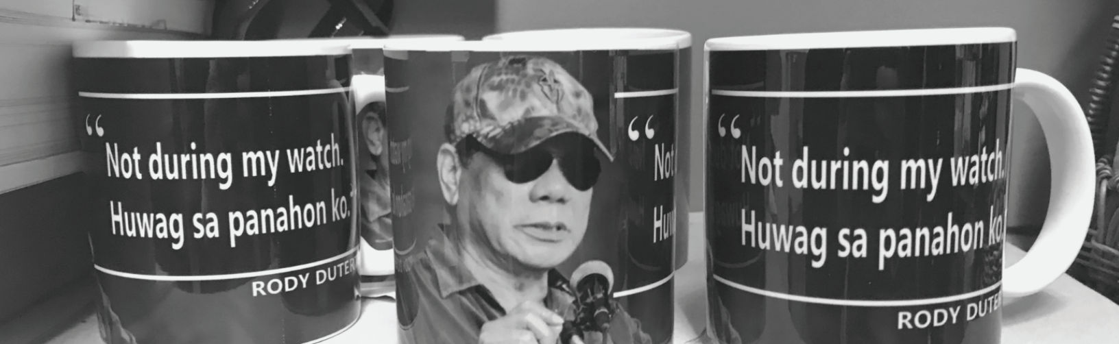
Coffee cups showing an image of President Rodrigo Duterte inside the House of Representatives building in Manila, January 2019.