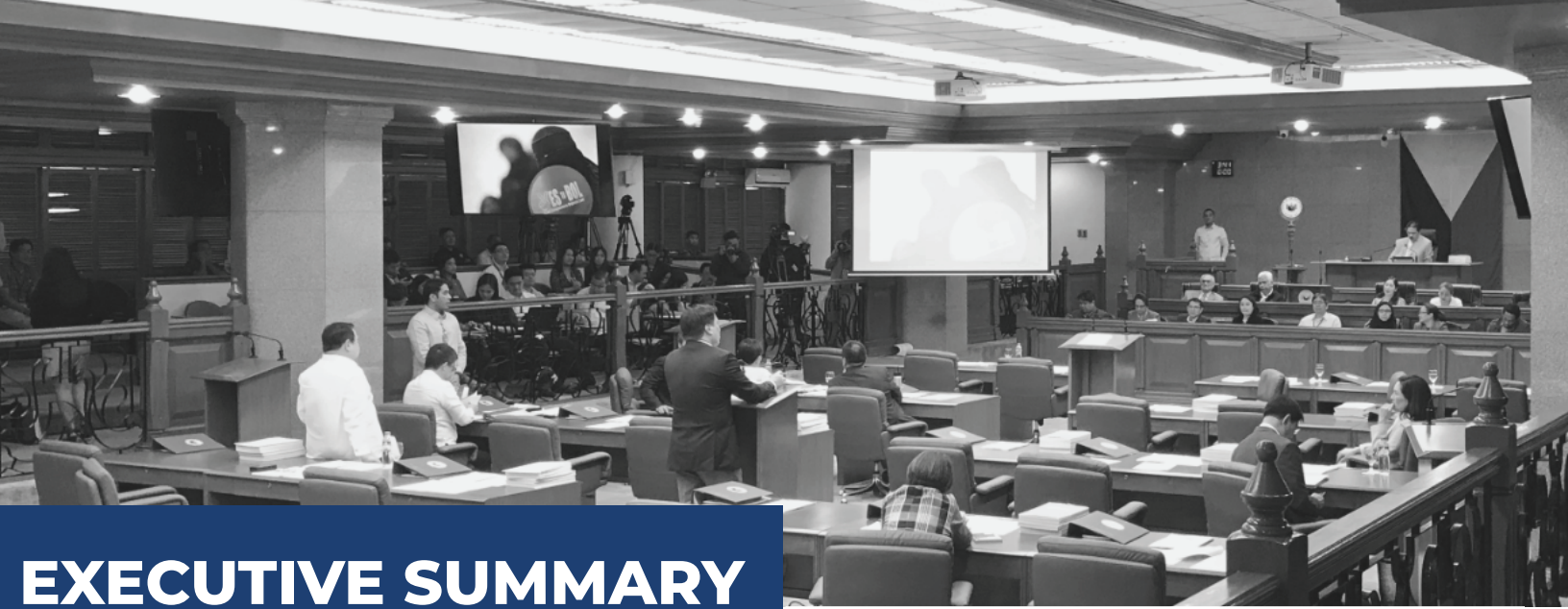
The Philippine Senate in session, Manila, January 2019.