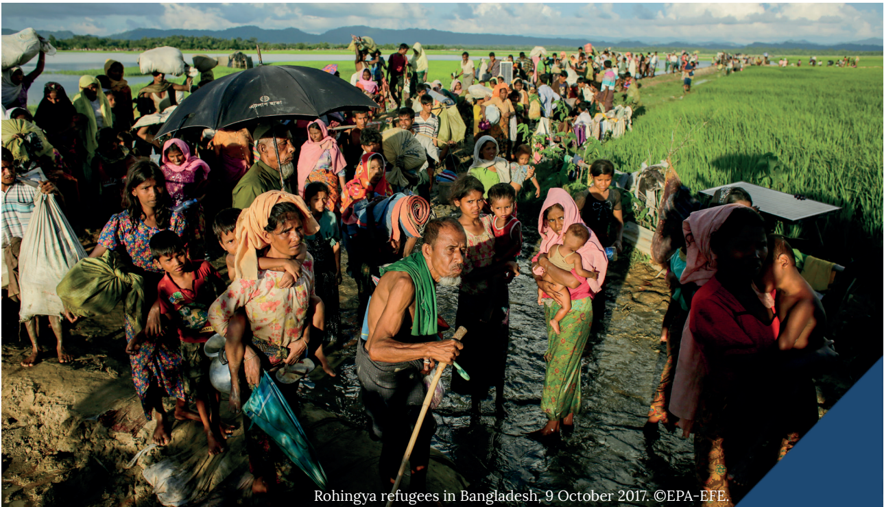
Rohingya refugees in Bangladesh, 9 October 2017.