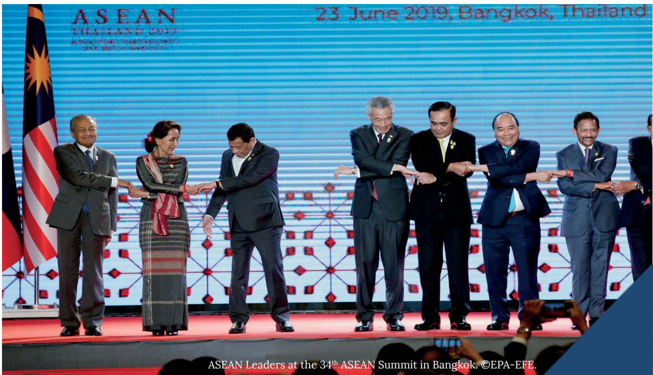
ASEAN Leaders at the 34 th ASEAN Summit in Bangkok.