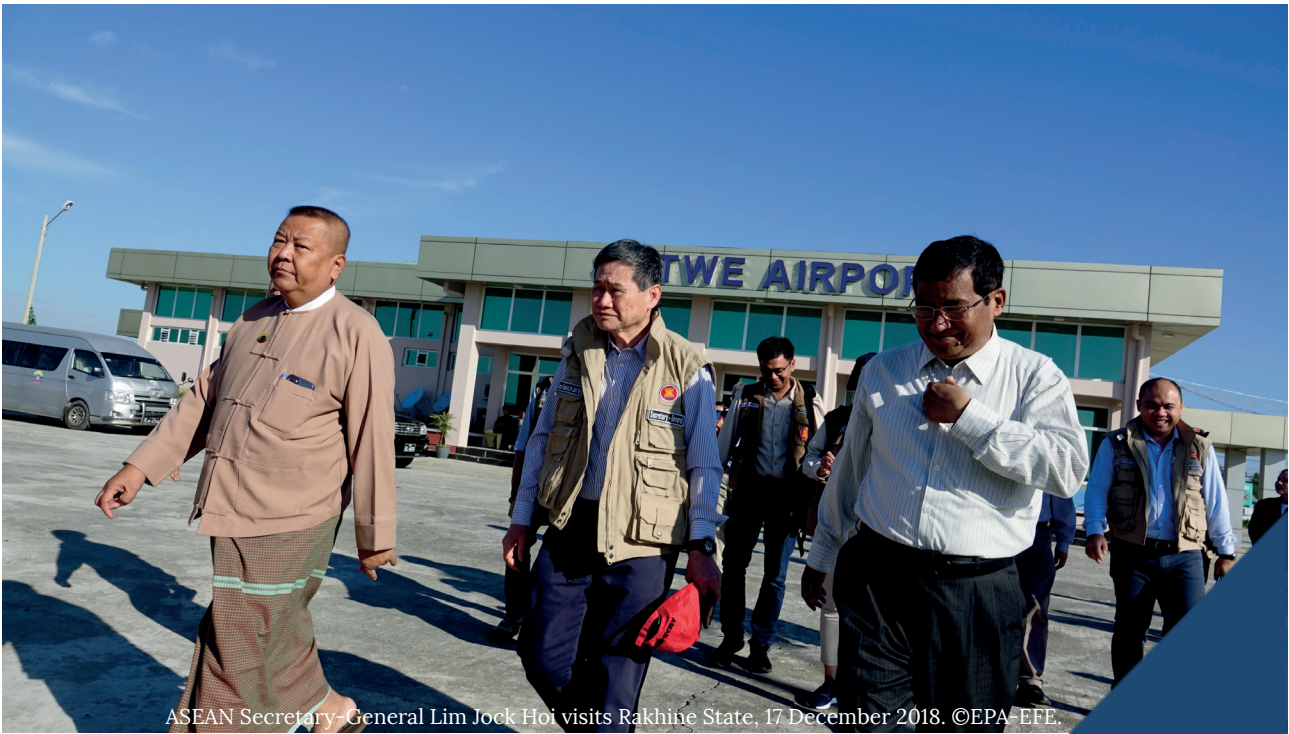
ASEAN Secretary-General Lim Jock Hoi visits Rakhine State, 17 December 2018.